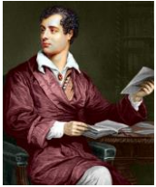
The portrait of Lord Byron, Poet